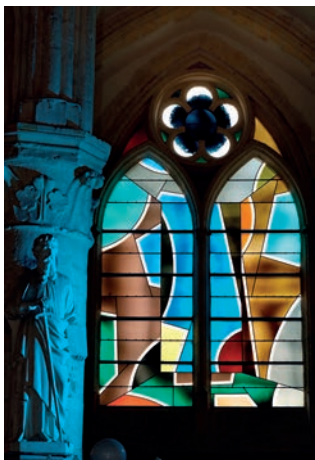
Saint-Pierre-Saint-Paul Church in Villenauxe- la-Grande (Aube), stained glass by David Tremlett, 2005

La Cité du Vitrail reflects the Aube Department's ongoing endeavours to promote tourism and culture, initiated in 2009 with an exhibition in Troyes of fine 16 th century sculpture from the Champagne region which attracted 71,000 visitors. This was followed by other events such as Templiers, une histoire, notre trésor in 2012, 1814, la C(h)ampagne de Napoléon (2014), Clairvaux, l'aventure cistercienne (2015), Si près des tranchées. L'Aube en 1916 (2016), Renoir dans l'Aube en Champagne (2017) and ArkéAube (2018/19).