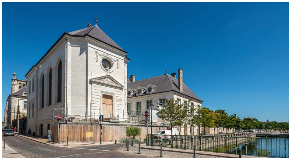
Hôtel-Dieu-le-Comte, Troyes (Aube)

La Cité du Vitrail is located within the Hôtel-Dieu-le-Comte in the centre of Troyes, between the Cathedral and the Saint Urbain Basilica, religious monuments which themselves feature prestigious stained glass artwork. Built at the site of the former hôtel-Dieu founded in 1157 by the then Count of Champagne, Henri I the Liberal, the Hôtel-Dieu-le-Comte is one of the rare large-sized edifices in Troyes dating from the 18 th century. The entire structure in the heart of the city's merchant quarter and cathedral district was classified as a Historic Monument on 23 November 1964.