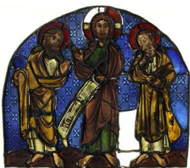
12 th century Troyes stained glass before restoration

The chef d'œuvre of La Cité du Vitrail's collection is a late-12 th century stained glass from Troyes which is in the process of being inspected ahead of its restoration. A bespoke room will be dedicated to the piece which represents the Transfiguration of Jesus. This extremely rare work disappeared at the beginning of the 20 th century but was acquired by the Aube Department at an auction in November 2018 following its accidental rediscovery.