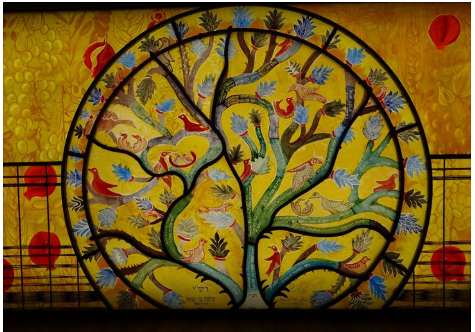
Rashi Cultural Centre in Troyes (Aube), Tree of Rashi , stained glass by Flavie Vincent-Petit