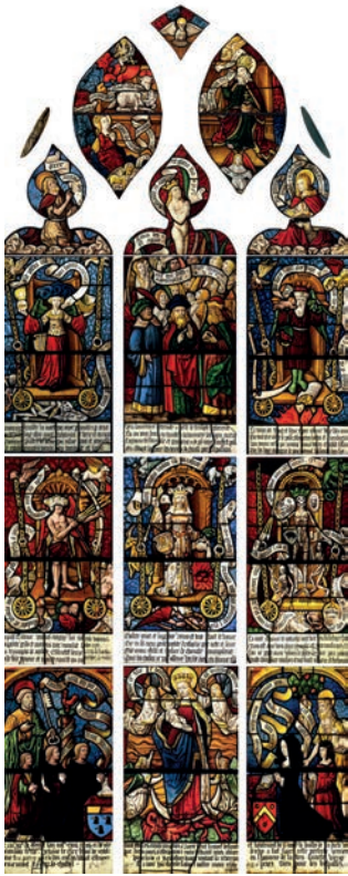
Church of Ervy-Le-Châtel (Aube), Triumphes de Pétrarque, 1502 © Manufacture Vincent-Petit