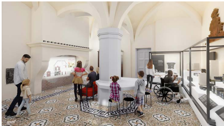
Pre-project © GSM Project - Cité du Vitrail - Troyes (Aube)

La Cité du Vitrail will provide visitors with the opportunity to explore the extraordinary diversity and historical, technical and aesthetic aspects of stained glass. The permanent exhibition will include numerous antique and contemporary masterpieces, many of which have been restored for the occasion. At the same time, an active acquisition and loan policy means exhibits will evolve regularly.