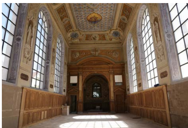
The chapel of the Hôtel-Dieu-le-Comte, Troyes (Aube), after restoration

Visitors will be able to move about easily inside, as each floor can be reached via a central staircase adorned with what is likely the original metal and wooden handrail. The building is also equipped with a lift ensuring accessibility to persons with reduced mobility.